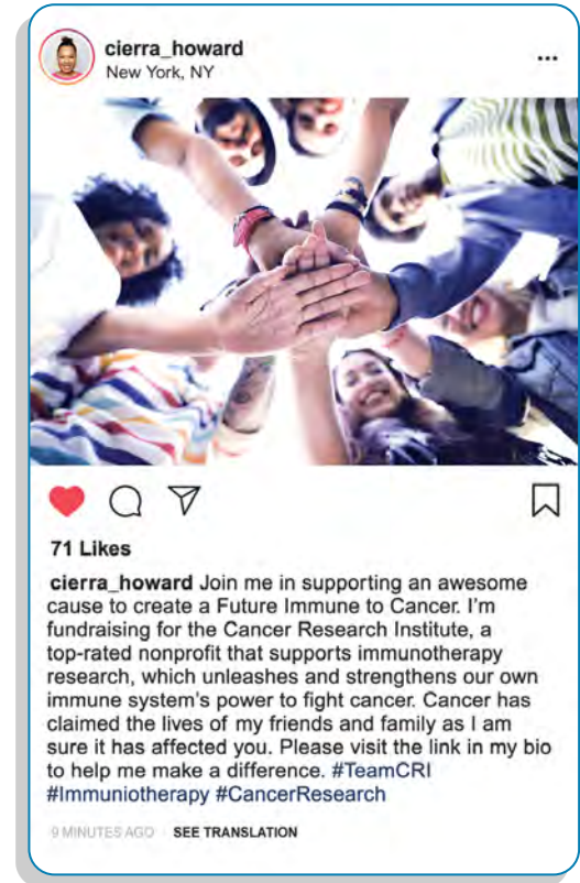
Sample Instagram Post