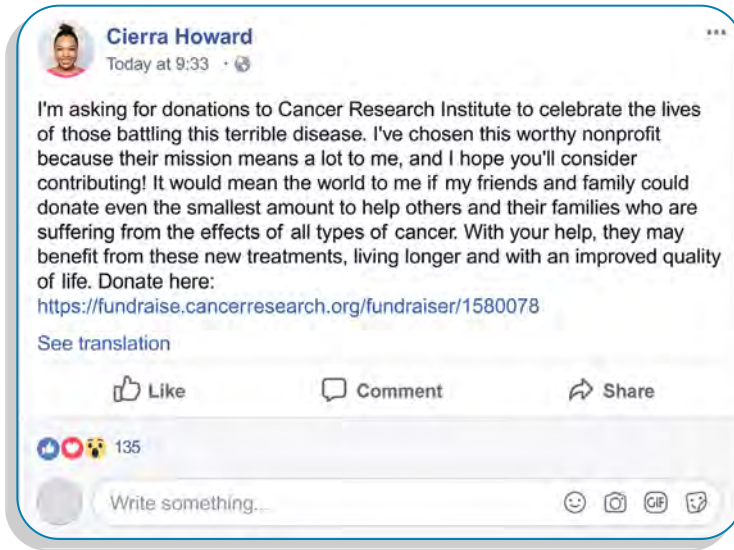
Sample Facebook Post

Finding the right words to use can be hard. Take a look at some of our sample messages for inspiration!