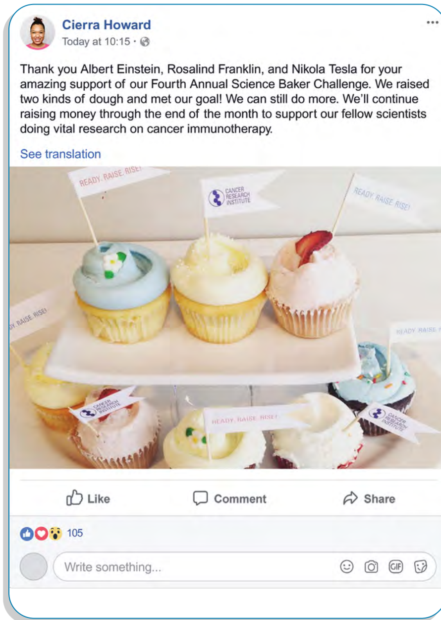
Sample Facebook Post

Don't just thank your donors. Show them the impact of their donations. Follow up with them in 3 or 6 months, sharing news from the Cancer Research Institute about how their donations are making lifesaving cancer research possible. Remind them of their support and you'll make it even more likely that they'll support you again for your next fundraiser.