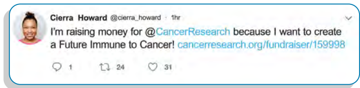
Sample Twitter Post